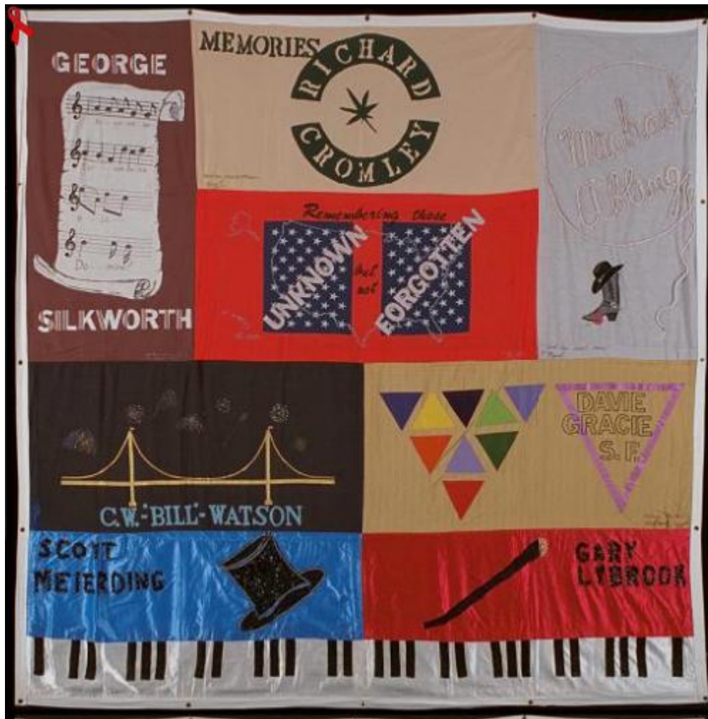
These are the names on Block # 147

Therefore, at Ray Of Hope Church Of Our Lord Jesus Christ, we continue to read aloud over 110,000 names sewn into the AIDS Memorial Quilt to keep HIV/AIDS in the conscious prayers of people. Scroll the page to see the panels on block 147.