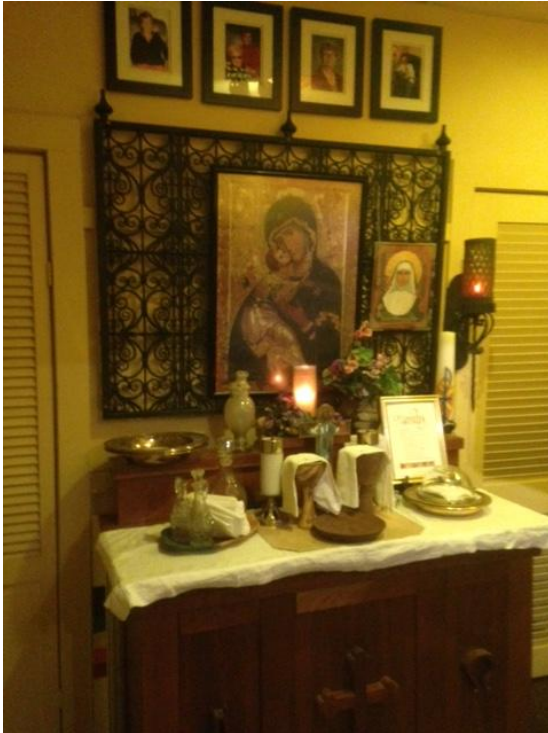
Our Elmira Chapel Foundresses' pictures are hung above and become part of the Credence Table/Altar dedicated to the Incarnation of the Eternal Word and His Blessed Mother Mary.