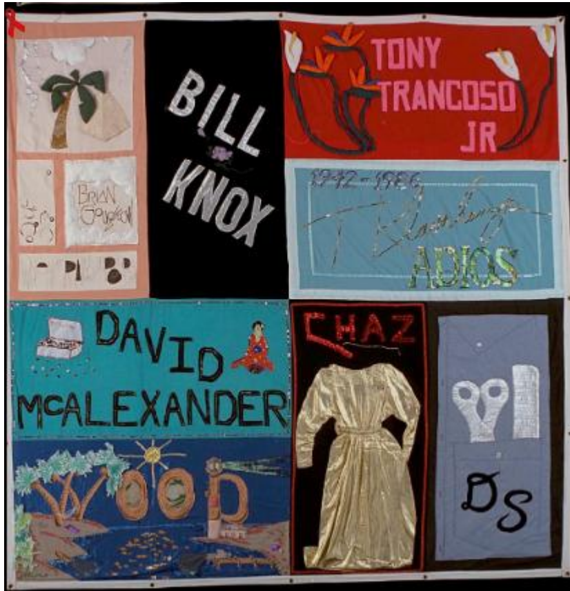
These are the names on Block # 184