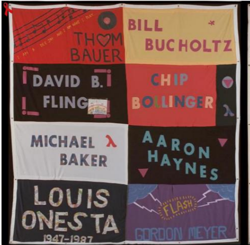
These are the names on Block # 144

3-30-25 Fourth Sunday of Lent, Laetare Sunday Women's History Month Week 5, Year C Page 7 of 41 to read aloud over 110,000 names sewn into the AIDS Memorial Quilt to keep HIV/AIDS in the conscious prayers of people. Scroll the page to see the panels on block 144.